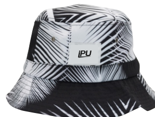
SUBLIMATED BUCKET HAT