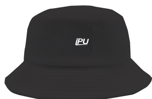
TERRY BUCKET HAT